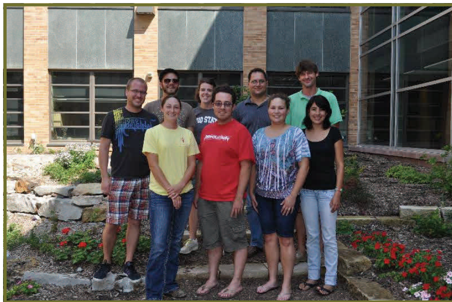
Fall 2011 Doctor of Plant Health Class at the University of Nebraska—Lincoln

THE MISSION OF THE DOCTOR OF PLANT HEALTH PROGRAM AT THE UNIVERSITY OF NEBRASKA—LINCOLN is to produce plant practitioners with broad expertise and experience across the various disciplines that impact plant health and plant management. These plant practitioners (plant doctors) will integrate from across this expertise to diagnose and solve plant health problems and to develop integrated plant and pest management systems that maximize the system’s economic, environmental, and social sustainability.